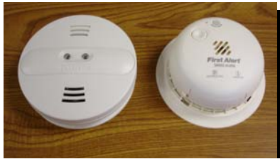
Kidde First Alert

(Red bags contain all necessary items - tools & alarms)